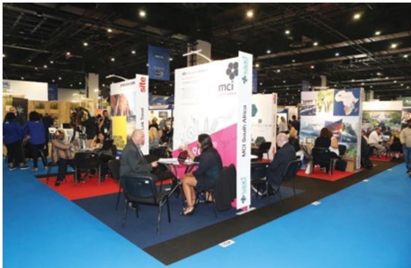
The show floor at Meetings Africa 2017