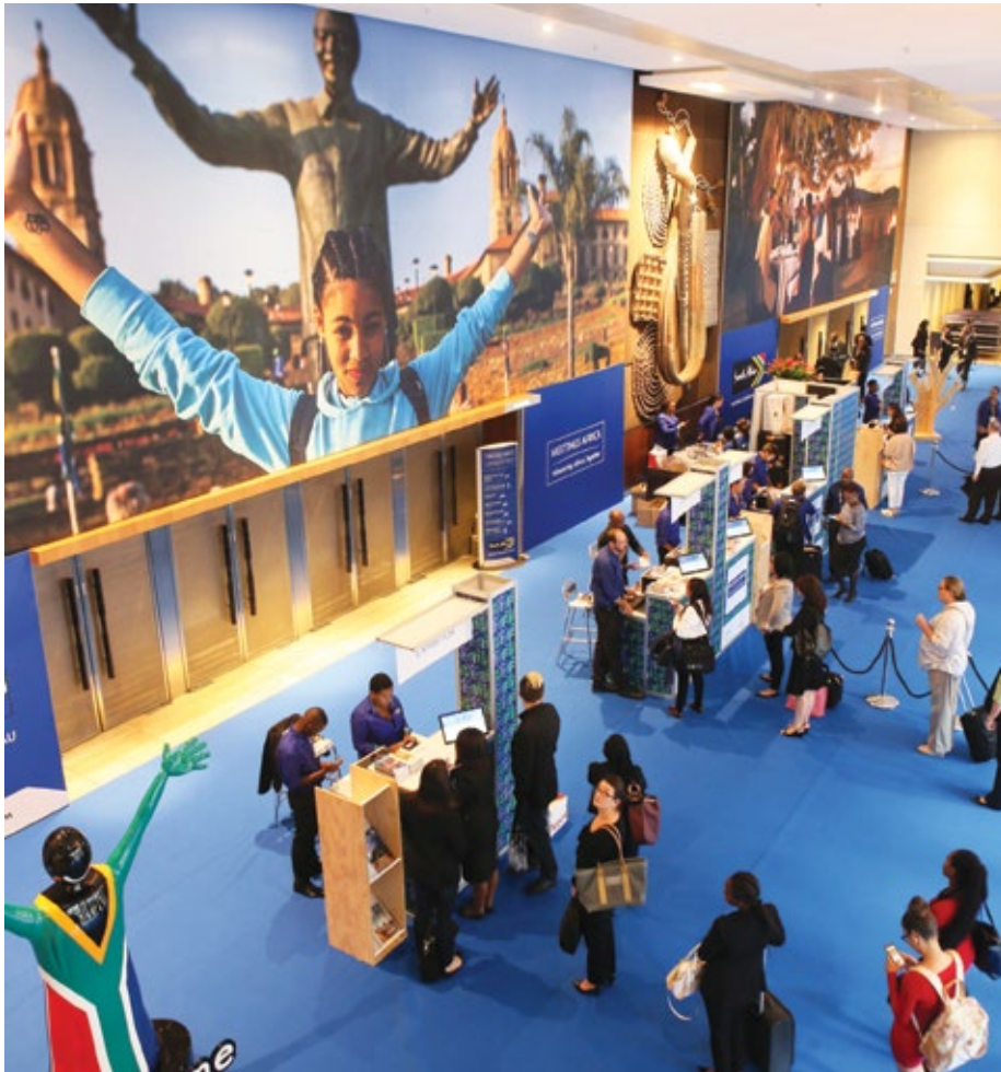
The show floor at Meetings Africa 2017