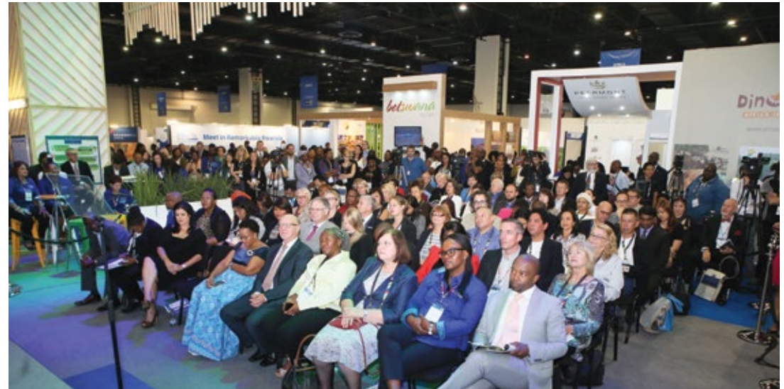
Meetings Africa Opening Ceremony 2016