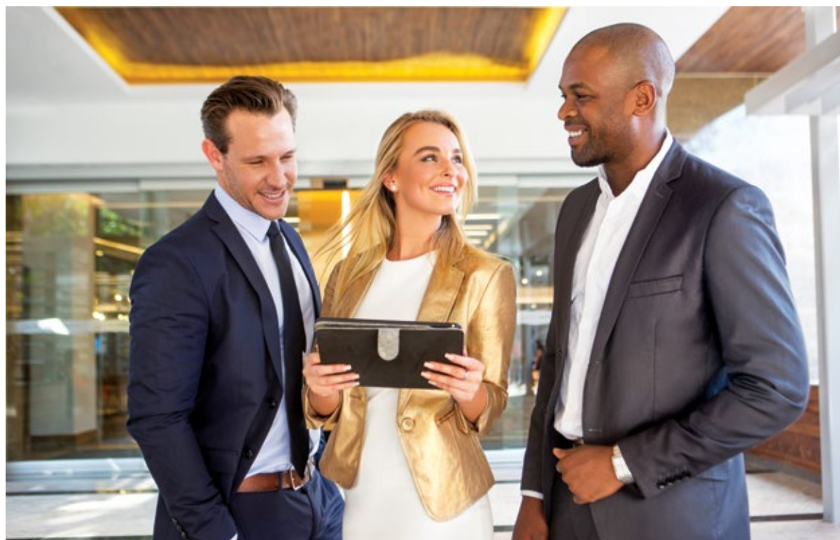
Sun City