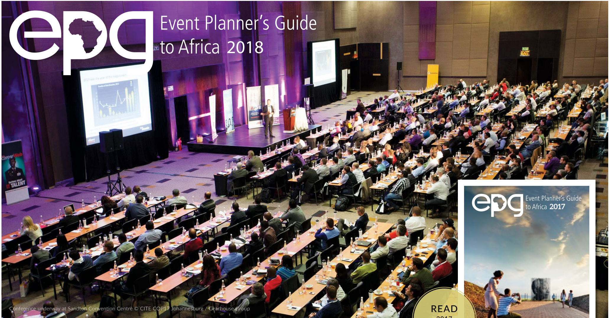
Conference underway at Sandton Convention Centre